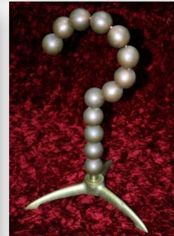
Homage To Picasso (T) Masculinity To Some (R) I See Lucy (L)