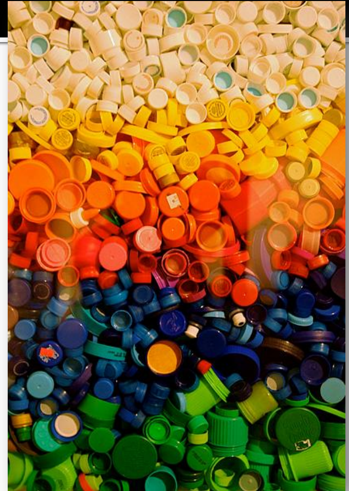
Bottle Caps