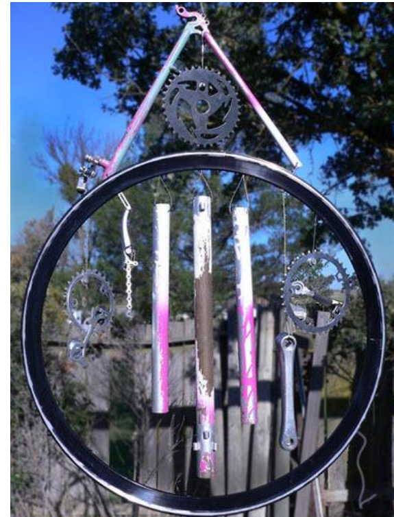
Atonement: bike rim, brake, shift cable, tubing, cranks