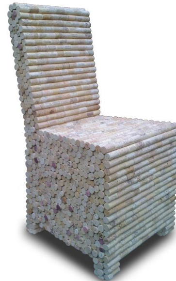
Can Lid Platter (T) Upright Cork Chair (L)