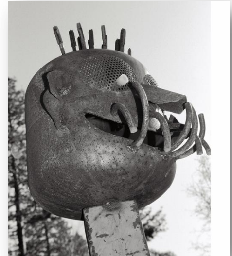
Metalica Dog Robot Man