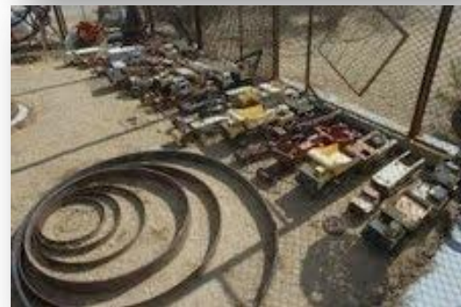
Bobby Furst's expansive studio and workshop