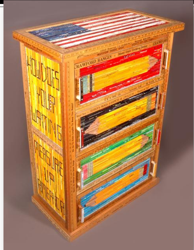
Write On America

“Write on America is made from recycled pencils collected by the students at Mirman School over a 3 year period. Each panel is framed in the metallic parts of the pencil that holds the eraser to the wood part of the pencil. The frame is made from vintage yardsticks and the handles are old carpenter's pencils.”