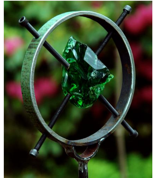
Oxygen Tank Ring, Steel, Glass