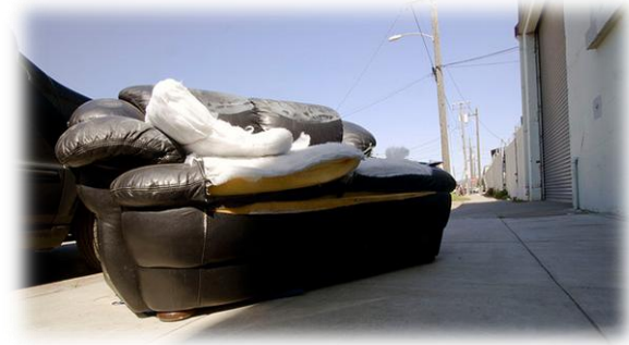
Thrashed Free

thrown on a trash heap what new-fangled life it lives by sunrise, skinned